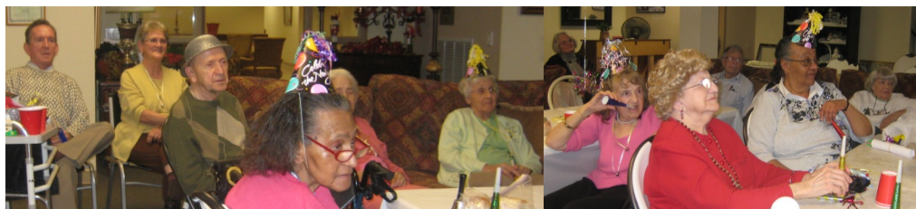
Residents watching “Rockin Eve.”